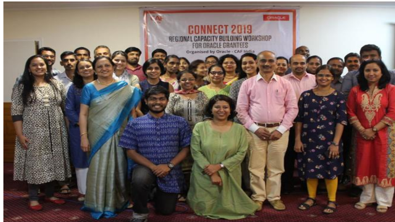
Participants at the CAF – Oracle Workshop

FFE participated in ‘CONNECT 2019’ a workshop, held on 9th July 2019 in Bangalore, by Charities Aid Foundation for NGO grantees of Oracle. The workshop addressed ideas for capacity building